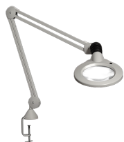
Light grey or white