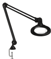
KFM LED ESD